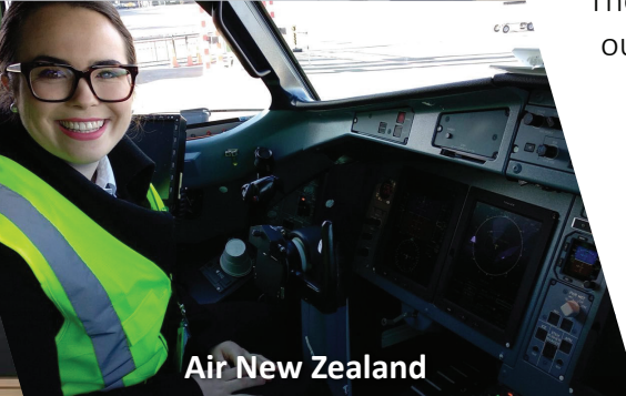
Air New Zealand